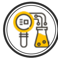
Test & Evaluation