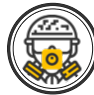
Chemical, Biological, Radiological, & Nuclear Defense