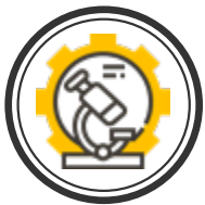
Research & Development